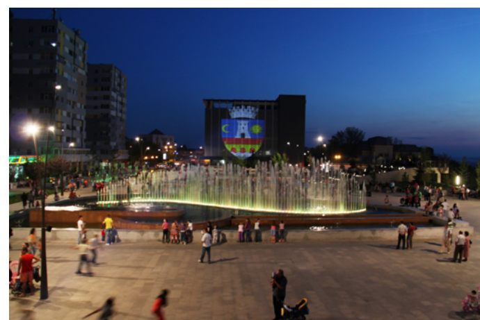
Evening in Esplanadă, central Slatina

After joining URBACT, the city set up a group of local stakeholders (URBACT Local Group) with the specific task of brainstorming towards the Sustainable Urban Mobility Plan. Far larger than expected, it gathered 97 people, from public officials in roads and transport, to security services, educational representatives, NGOs and the media. It also included local and international businesses whose operations would benefit from improved transport.