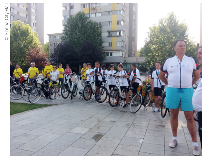
Representatives of Slatina's new e-bike initiative