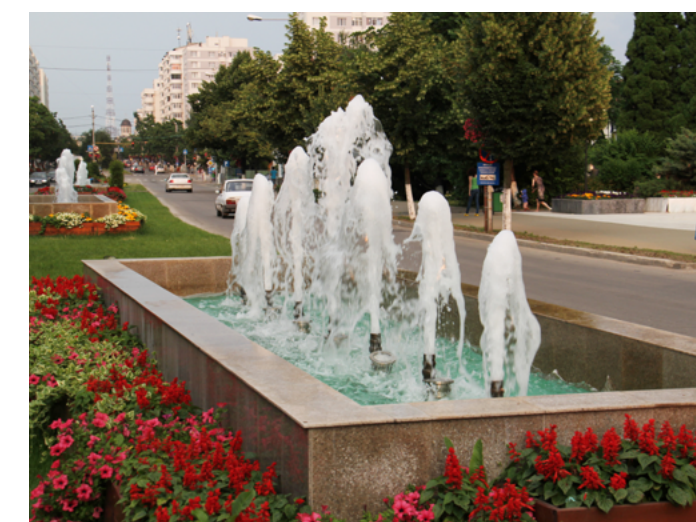
The municipality of Slatina has been working to beautify the city's roads