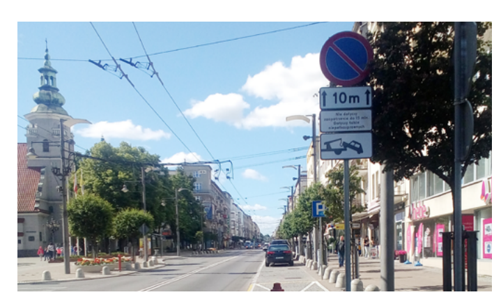
Freight management in the city

\Lambda local group helped improve delivery traffic measures in downtown Gdynia, \mathsf{A} contributing broader proposals to the city's Sustainable Urban Mobility. Plan – the first scheme of its kind in Poland. URBACT connected the municipality with experts and EU cities experienced in urban freight management.