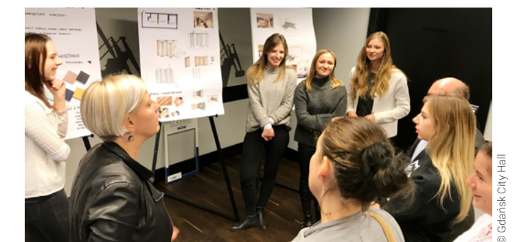
URBACT Local Group members present their design ideas for a neighbourhood house