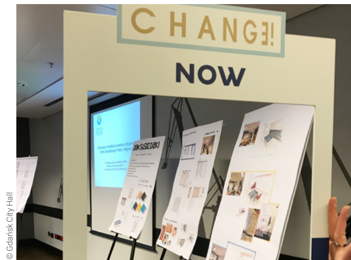
Winning entries from the URBACT Local Group design competition

"It was useful for us to focus on concrete solutions. We encountered a lot of subtle things that we wouldn't have been able to see in, say, a document."