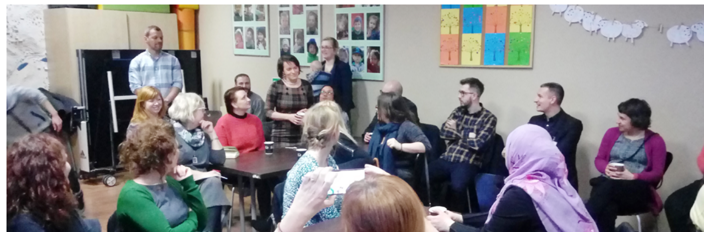
The URBACT Local Group meet at the neighbourhood house in Orunia

Orunia is home to one of the first and most successful examples. The district's neighbourhood house receives over 1 000 visits a month and functions, among other things, as a youth centre, debate club and immigration advice centre. The surrounding area has also seen a 1 000% increase in social initiatives since it was established.