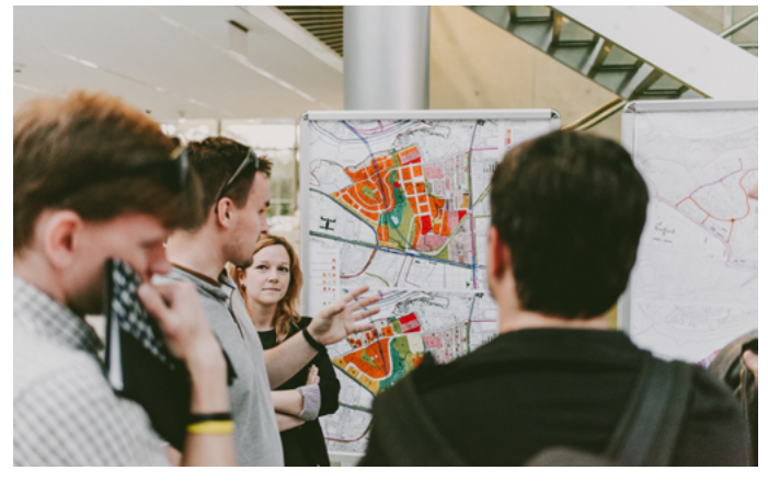
The final local group meeting

This article features in the URBACT publication 'Cities in Action - Stories of Change, December 2018