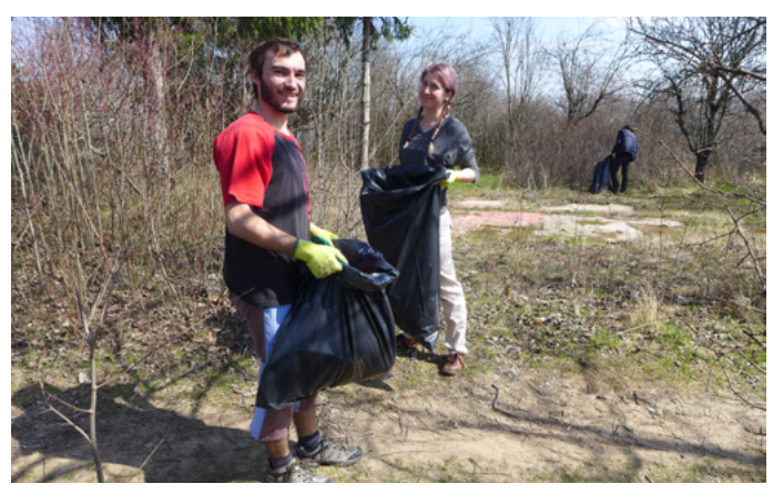
Cleaning up the pilot site of Red Hill

Finding a pilot location required unprecedented cooperation between municipal offices. As a requirement from the