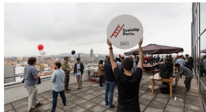
Meeting for the ScaleUp Porto