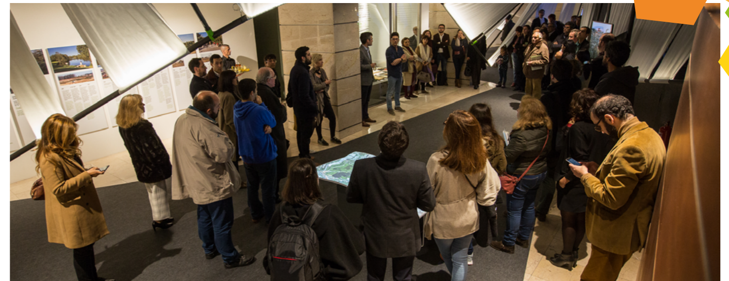
Meeting at the Porto Innovation Hub