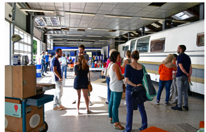
The Ilotopia hub

Île de Nantes is now one of Europe's largest urban regeneration sites. Its temporary uses have made it a hub for creative industries and diversified Nantes' economy. The island serves as a laboratory for urban redevelopment, home to street art companies, design laboratories, co-