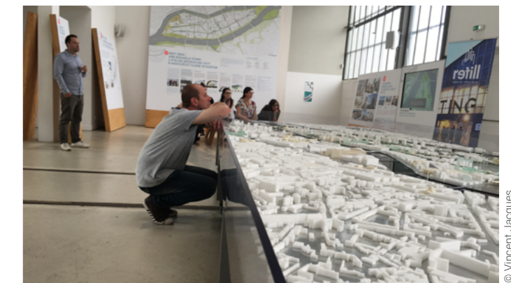
Partner cities visiting Nantes