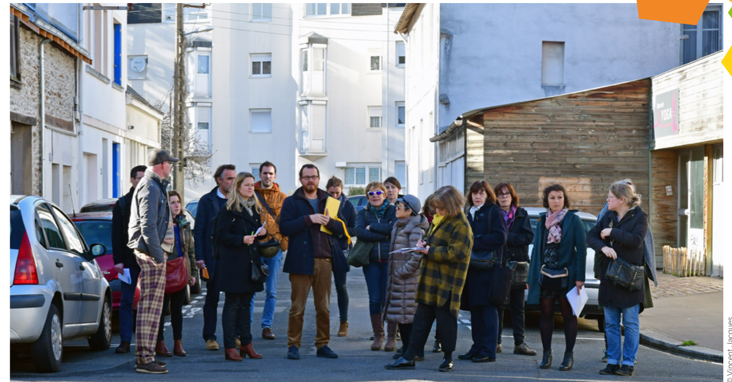
Ilotopia's citizens engagement walk

working spaces, bars, galleries, and a theatre. Some of the space is programmed without any defined use, building in a flexibility that allows the city to be nimble and responsive. Following the cultural and economic success of these short-term initiatives on the island, SAMOA is now planning to incorporate temporary use strategies as part of the island's longer-term development plans – proving that 'meanwhile' use doesn't need to end when redevelopment starts.