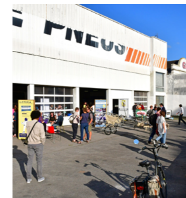
Participation at Ilotopia