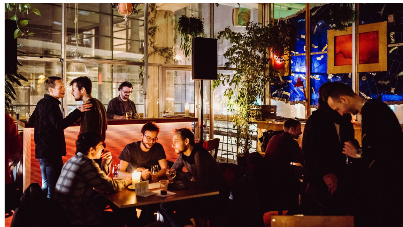
NEST: a sense of creative community

Ghent also improved communication and promotion of temporary use projects — which are shown in a digital map on the City of Ghent website. A university study provided a framework for assessing the impacts of temporary use, which the city now hopes to implement. And what started as the REFILL local group will continue as a temporary use learning network, backed by the city's Policy Participation Service, of which the neighbourhood managers are part.