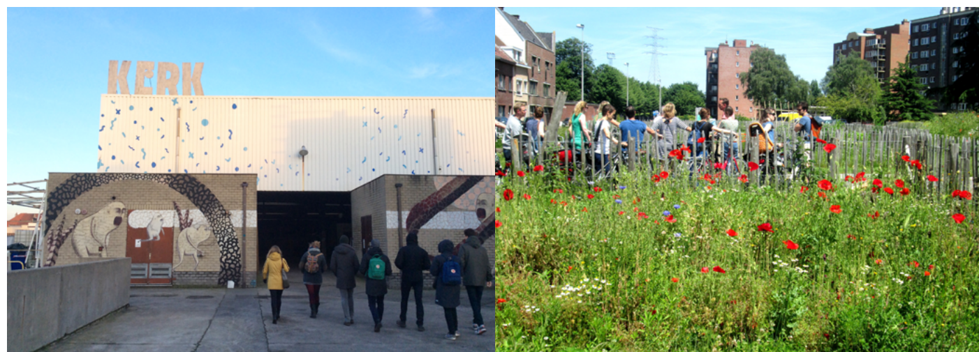
URBACT Local Group visit temporary use projects in Ghent

Because of this wealth of experience — matched with the desire to formalise such activity, evaluate best practice and collaborate internationally — Ghent became Lead Partner for the URBACT REFILL network.