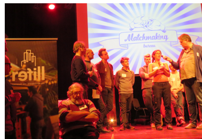
Ghent's Match-Makers event