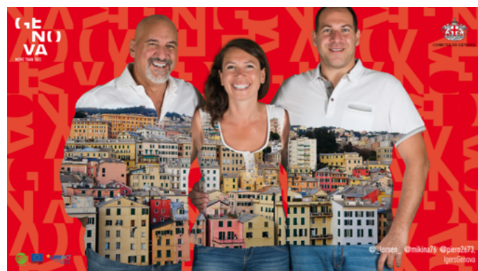
Genoa's social media ambassadors

Leading the URBACT INTERACTIVE CITIES network, Genoa explored social media to enable citizen participation in promoting the city to tourists, workers and business. This work is now providing a basis to respond to the trauma experienced when Genoa's Morandi Bridge tragically collapsed in August 2018.