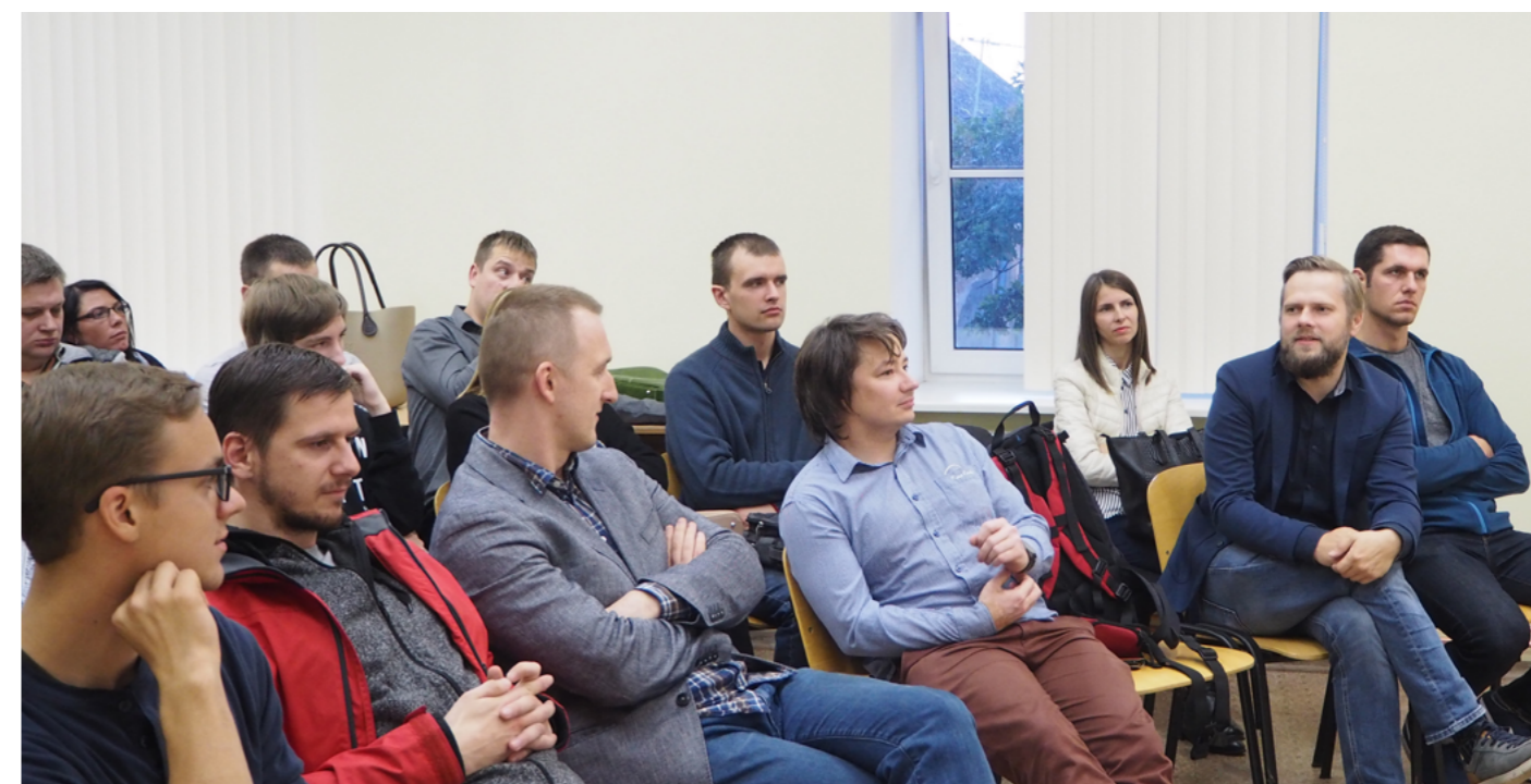
A meet-up with people interested in digital economy