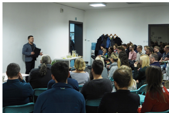
Meeting with the digital people

By working closely with schools, universities and businesses, local authorities in the historic town of Cēsis have made major steps to boost digital education and entrepreneurship.